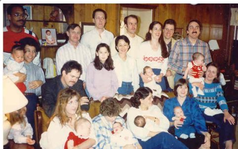
1986: First Baby Reunion was in February and evolved to Family Reunions as members brought older children as the years passed.