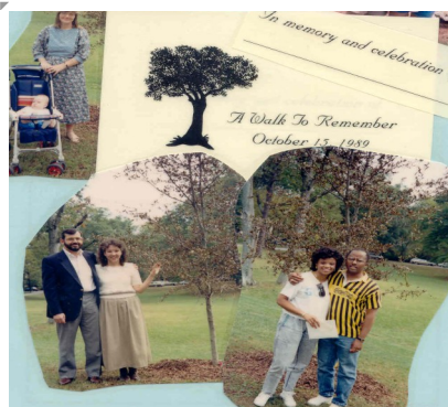
1989: First Walk to Remember , at Springdale Park, on Ponce De Leon was a "Walk to Remember" and a tree planting on October 15.