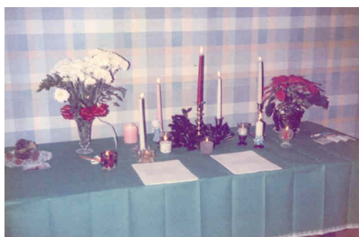
1985-Ongoing: First group meeting was on 1.85. These are SA's first memorial candles - Dec. '85.