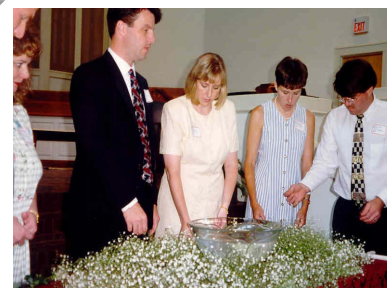
1996: First Memorial Celebration in May was at St. Luke's Presbyterian Church.