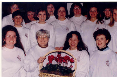
1990s: Volunteer retreat weekends or Saturdays to work on SHARE Atlanta's path, to educate our leaders, to refresh our bonds of friendship, to relax and have fun.