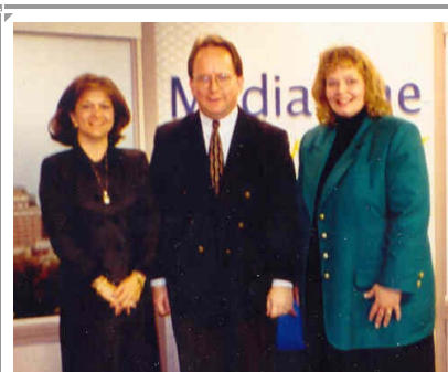
1986-Ongoing: Hospital inservices began, continued, & spread to radio, television and newspaper coverage for advocacy and awareness .