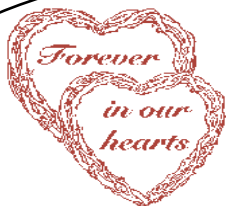
Pregnancy and Newborn Loss Grief Support Group

1994: SA logo was created because we needed a logo and tag line for our newsletter and our increasing number of brochures and booklets that we had written since the mid 80s.