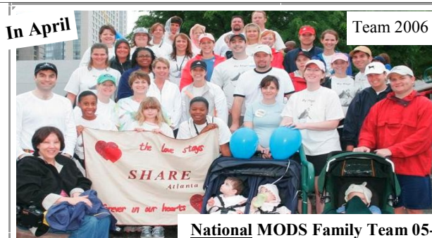
National MODS Family Team 05-10 Out of 10,000!

http://www.shareatlanta.org/outreachmenu.htm for details