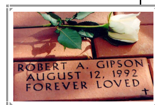
SHARE Atlanta Memorial Brick Order Online