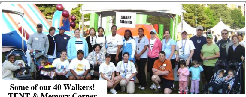
Some of our 40 Walkers! TENT & Memory Corner