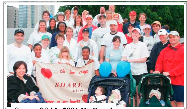
Some of SA’s 2006 Walkers!