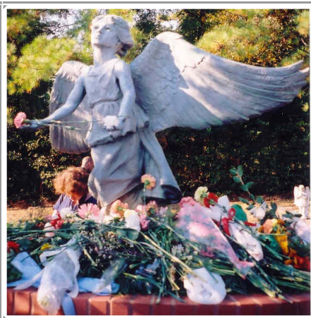
SHARE Atlanta's angel is the 24th Christmas Box Angel of Hope in the United States.

If the bricks could talk, what amazing and timeless stories they would surely tell.