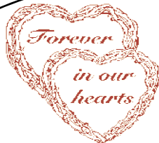
1994: Our logo was created because we needed a logo and tag line for our newsletter and our increasing number of brochures and booklets that we had written since the mid 80s.

Pregnancy and Newborn Loss Grief Support Group