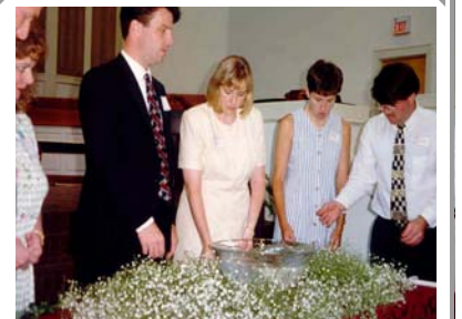
1996: SHARE Atlanta's first annual Memorial Celebration in May was at St. Luke's Presbyterian Church.