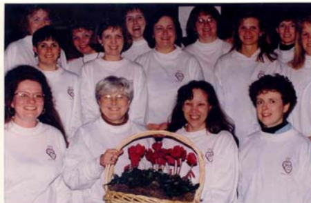
1990s: Volunteer retreat weekends or Saturdays to work on SHARE Atlanta's path, to educate our leaders, to refresh our bonds of friendship, to relax and have fun.