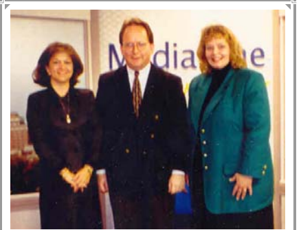
1986: Informal inservices began and continued in the 90s with radio, television and newspaper coverage for advocacy and awareness.