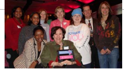
SHARE Atlanta Members March of Dimes 2007

More entries http://www.shareatlanta.org/shareatlprograms.htm