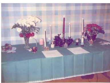
1985: Our first official group meeting was on 1.85, and these are the first memorial candles in Dec. '85.