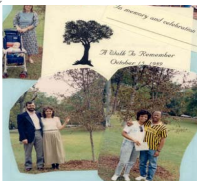
1989: First Memorial service, at Springdale Park, on Ponce De Leon was a "Walk to Remember" and a tree planting on October 15.