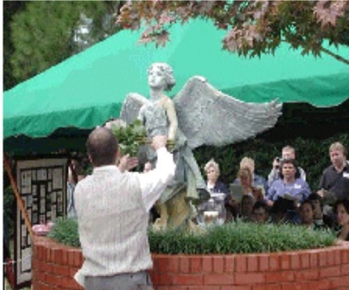
SHARE Atlanta's Angel Memorial Service

770.928.9603 www.shareatlanta.org Est. 1984