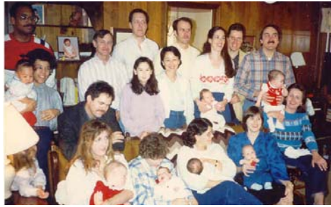
1986: First Baby Reunion was in February and evolved to Family Reunions as members brought older children as the years passed.