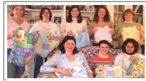
SA Moms with Blankets 2004